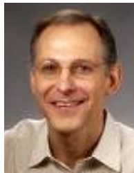
Ezekiel J. Emanuel, M.D., Ph.D. Chair, Department of Clinical Bioethics The Clinical Center National Institutes of Health