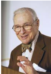
Kenneth J. Arrow, PhD Professor Emeritus Of Economics And Of Operations Research Stanford University Nobel Laureate, Economics