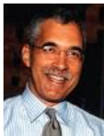
Claude Steele, PhD Director CASBS