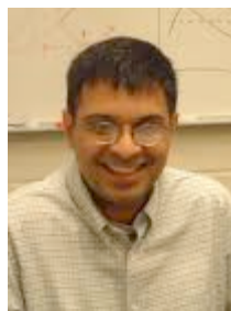
Jay Bhattacharya, MD, PhD Associate Professor, Medicine - Primary Care Outcomes Research, Stanford School of Medicine, Stanford University jay@stanford.edu