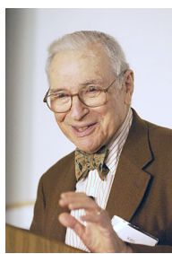
Kenneth J. Arrow, PhD , Chair of the Advisory Committee, FRESH- Thinking Joan Kenney Professor of Economics, Emeritus, Stanford University 1972 Nobel Laureate in Economics arrow@stanford.edu